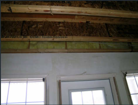
Water Penetration Repair