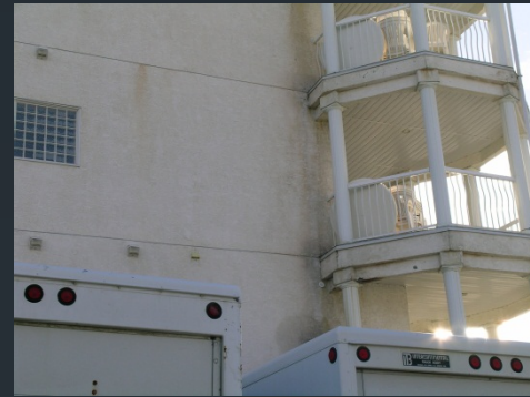
Failed Soffit & Stucco