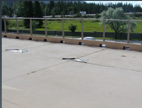
Failed Deck Membrane