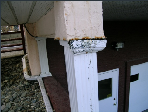
Failed Column & Soffit