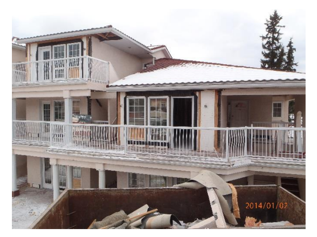
Building 300 Exterior Work – Removal of Stucco in Preparation for Deck and Patio Removal